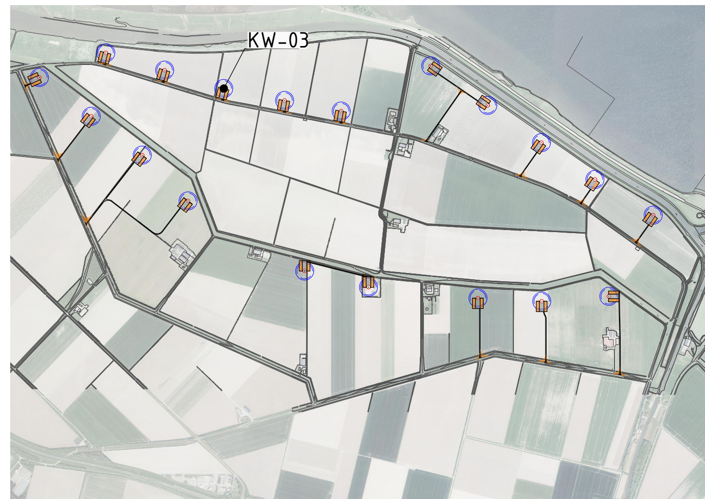
SITUATIE schaal 1:25.000